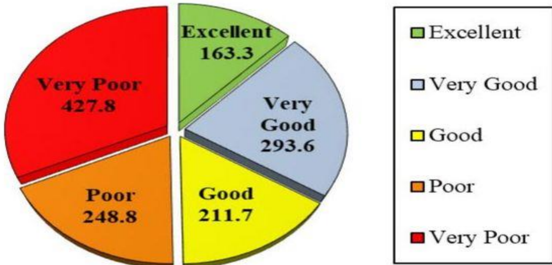
Centerline Miles of Streets by Condition