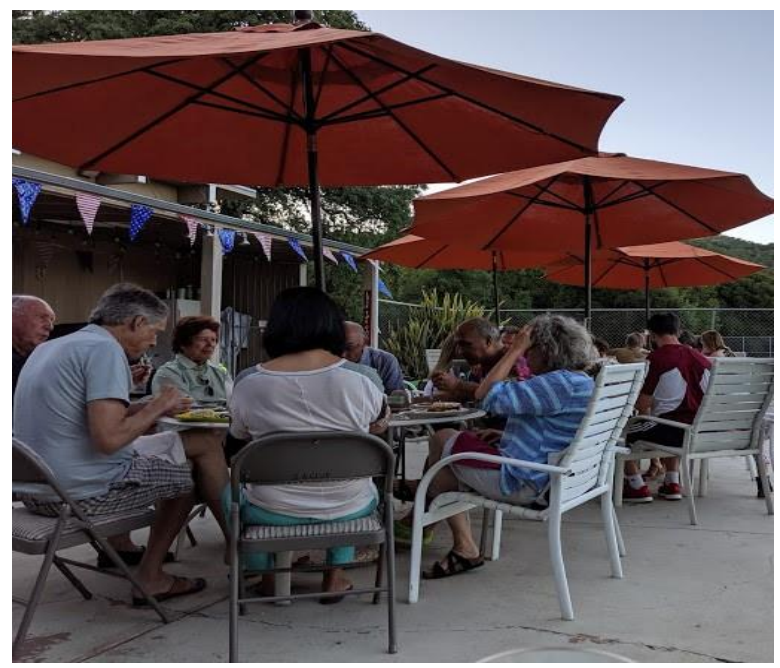
A typical gathering at the Weekly Wednesday Night BBQ.