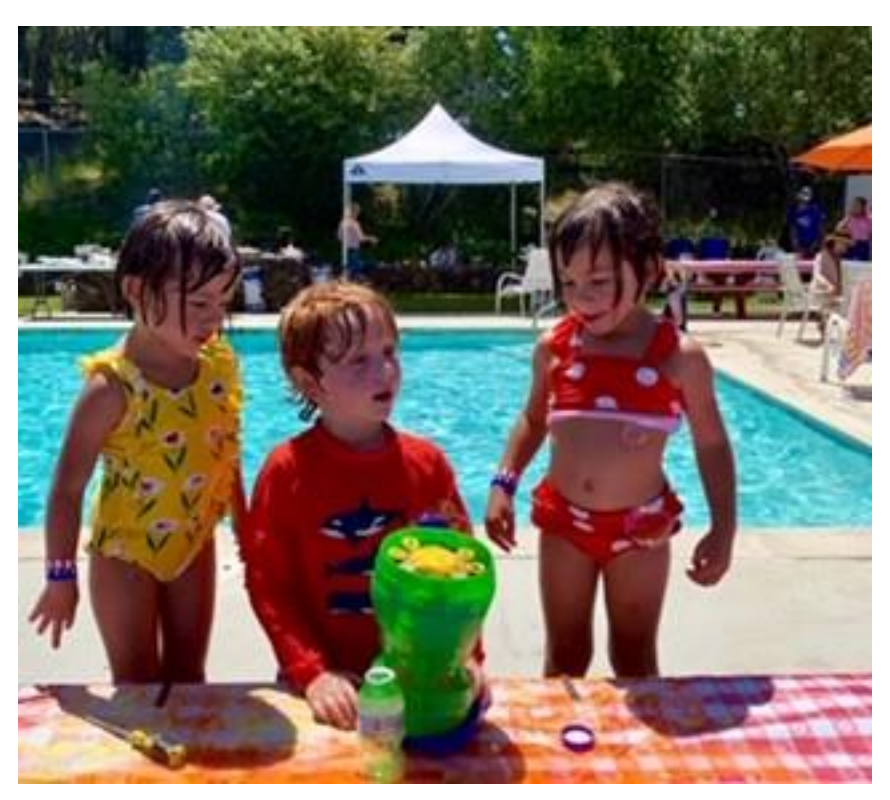
It's All About the Kids