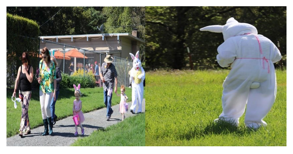
The Egg Hunt Begins!