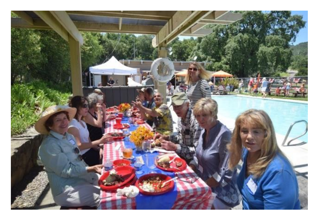
Diamond A Neighbors Enjoying the Fabulous Food at the Picnic

Below is a list of the remaining 2019 Social Events we have scheduled.